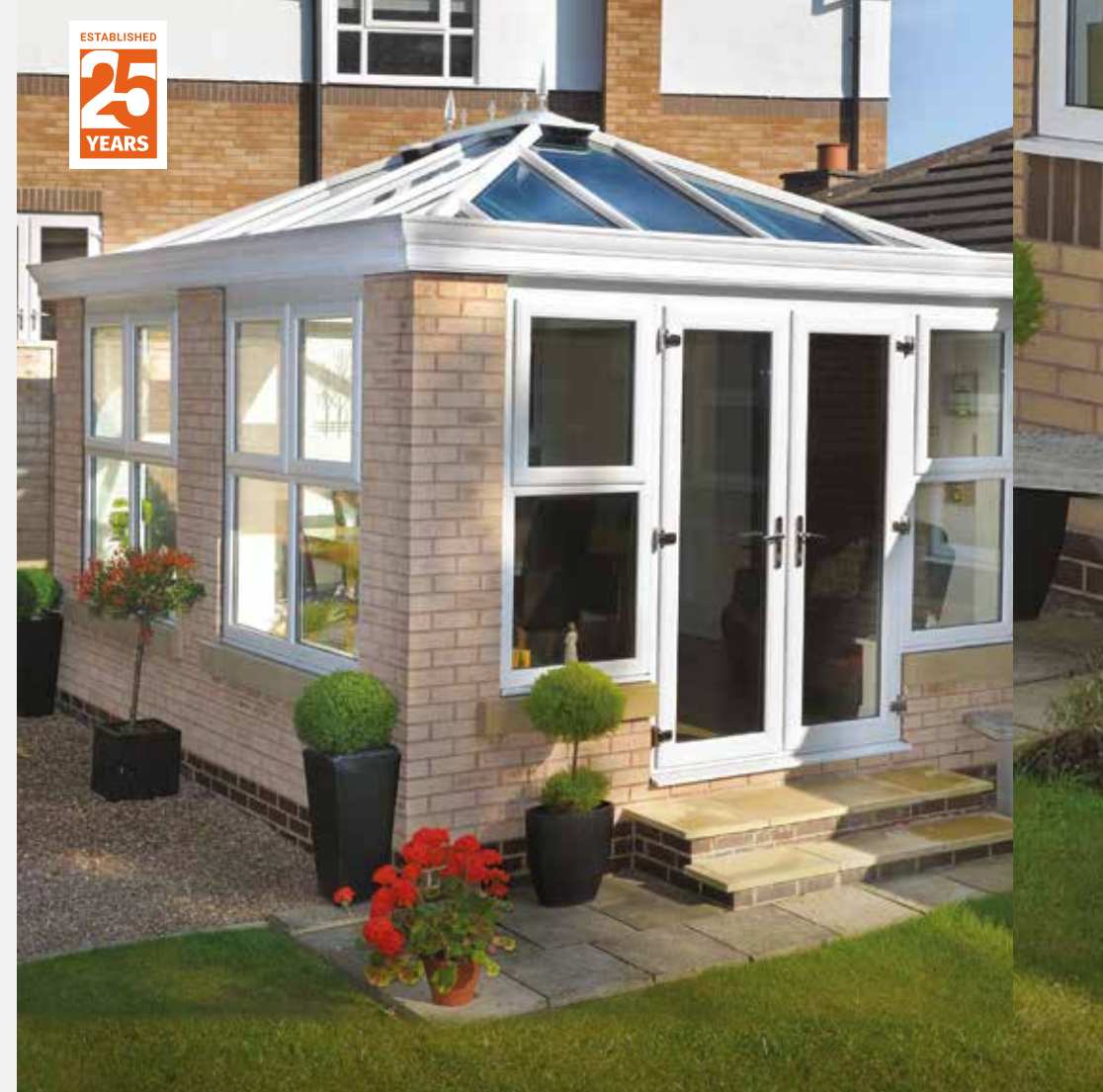
High Quality Glass Roof