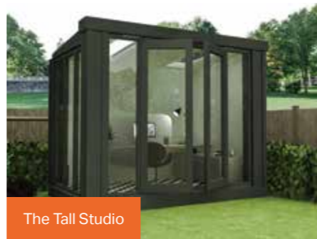
The Tall Studio

With extra height The Tall Studio at 2900mm high is ideal for a variety of activities, and perfect for home gym equipment.