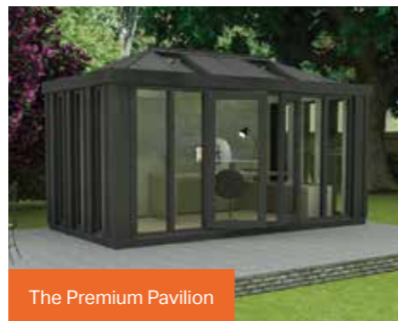
The Premium Pavilion

The inline columns, available exclusively on The Premium Pavilion, not only make a style statement but enable you to have 3 glazed walls which deliver a high thermal performance and bring in even more natural light.