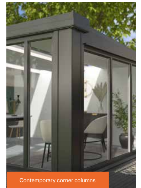
Contemporary corner columns