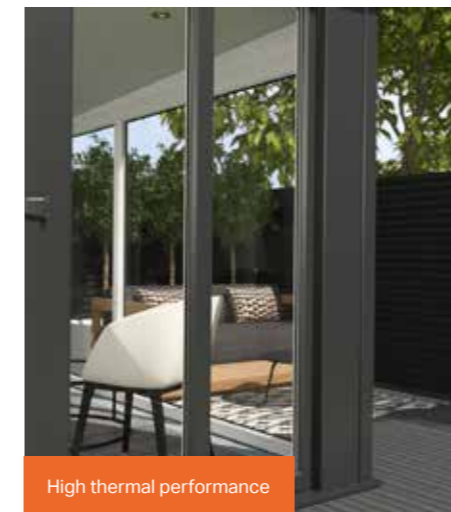
High thermal performance