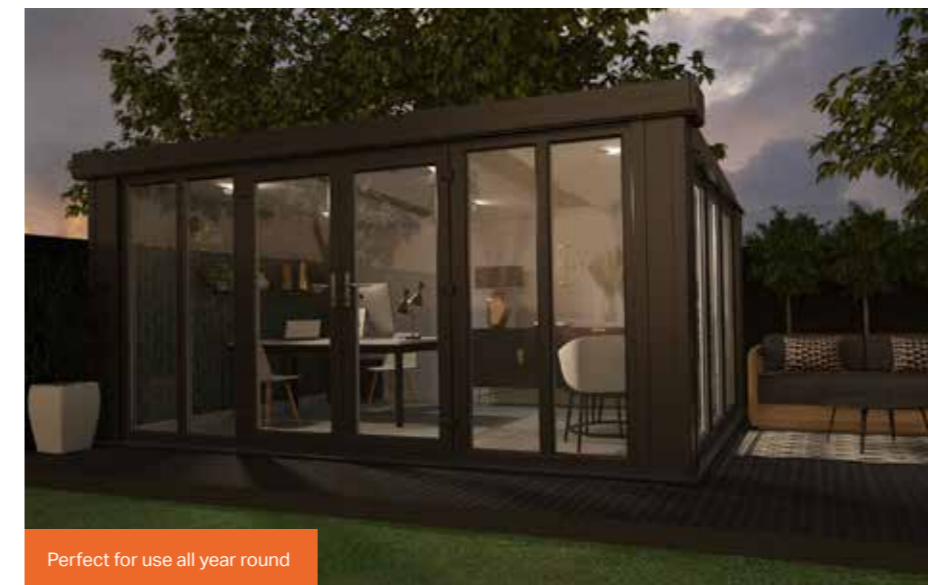
Perfect for use all year round